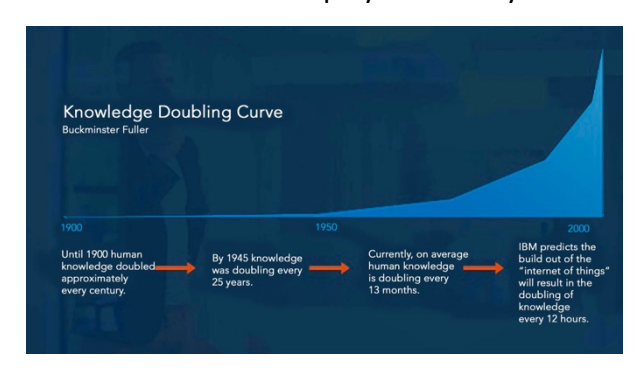
Figure 1: Knowledge doubling curve

Hence, although knowledge increased throughout history, its greatest growth was not seen until most people had access to it in the 20<sup>th</sup> century as it can be seen in Figure 1. With the Industrial Revolution as a main driving force of it, the transmission and creation of knowledge expanded exponentially thanks to a specific context and certain circumstances in which the role that institutions played was key.